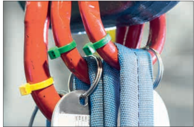
T-Series cable ties – ideally suited for colour coding.